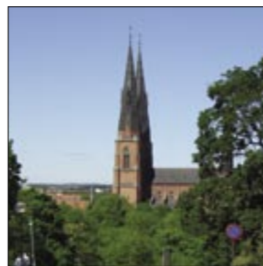
In Lilla Sunnersta, you live close to town, the faculties and the university. The city centre is only 7 kilometers away.