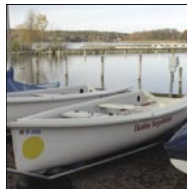
Mälaren is within walking distance. Lilla Sunnersta features brand new student housing with a touch of quality. The two-storey buildings are situated at the edge of the great fields by Ultuna, next to Sunnersta residential district.