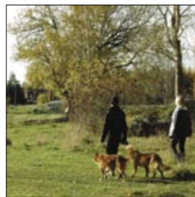
Lilla Sunnersta is a newly constructed residential area with apartments for students in Uppsala. The location is perfect. Close to town, as well as nature.

Your own apartment, for complete freedom. You can make your own decisions. Studio, well planned kitchenette with full size stove, and freezer. 25 m 2 .